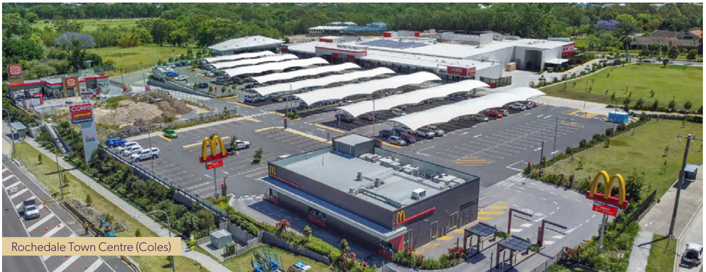
Rochedale Town Centre (Coles)

There are several local schools within five kilometres including Redeemer Lutheran College, Rochedale State School and Mansfield State High School.