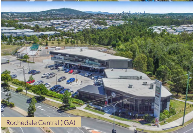
Rochedale Central (IGA)