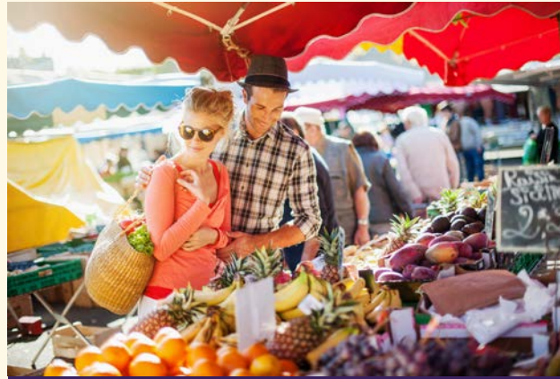
Markets every weekend