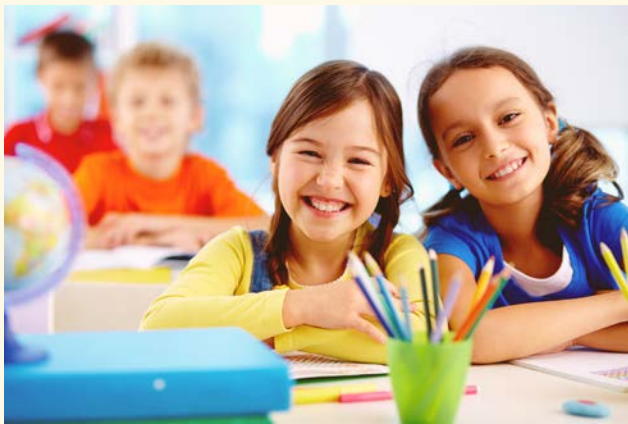
Primary school within walking distance