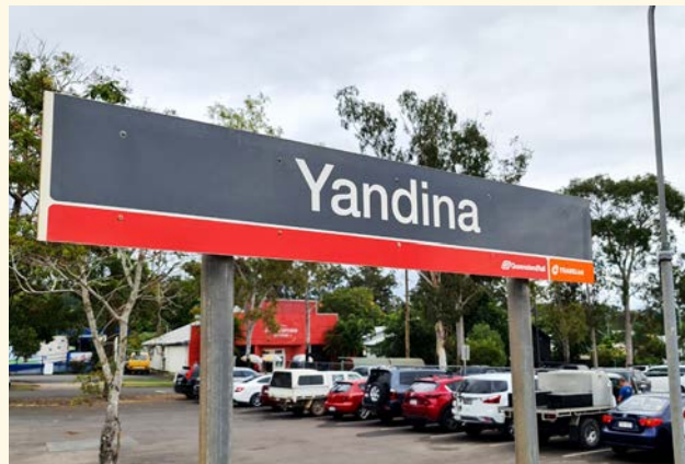
Local train station