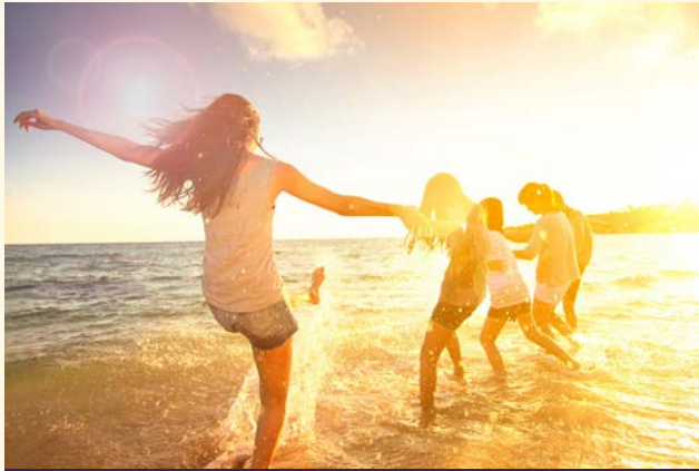
Close to the beach